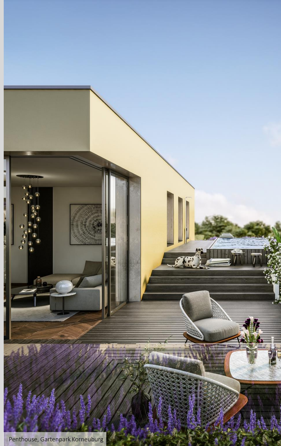
Penthouse, Gartenpark Korneuburg

In doing so, the group will cover the entire value-added chain, including land acquisition, project strategy, planning, construction, project management, utilisation, administration, operation, and all support processes. The individual companies as part of the Wiener Komfortwohnungen Group will each act as a (partial) general contractor at standard market prices.